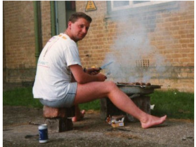
Sunday afternoon, pubs shut, and an impromptu BBQ at G block with a dustbin lid! H&S non-existent